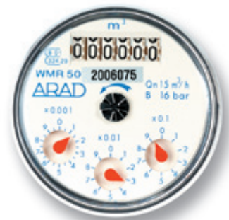
WMR type dial